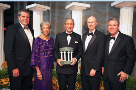
2010 Arthur M. Blank