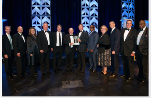
2015 Dan T. Cathy