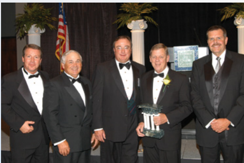
2005 U.S. Senator Johnny Isakson