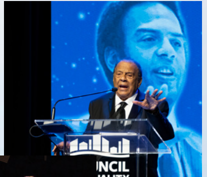
2021 Ambassador Andrew Young