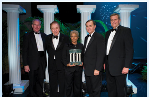
2009 Mayor Shirley Franklin