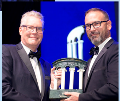
2023 Ed Bastian