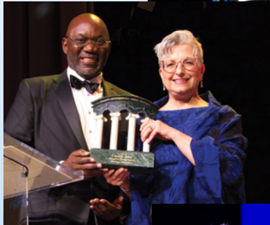
2022 Carol B. Tomé