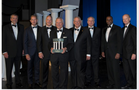
2017 Governor Nathan Deal