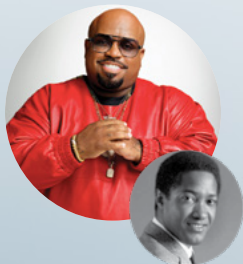
FIVE-TIME GRAMMY AWARD WINNER