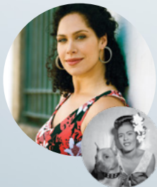
DAUGHTER OF ATLANTA'S 54 TH MAYOR MAYNARD JACKSON