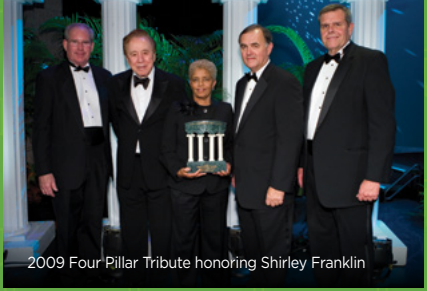
2009 Four Pillar Tribute honoring Shirley Franklin