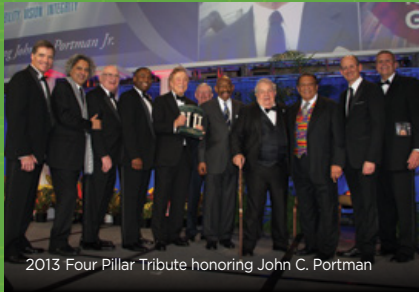
2013 Four Pillar Tribute honoring John C. Portman