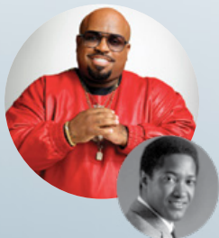
FIVE-TIME GRAMMY AWARD WINNER