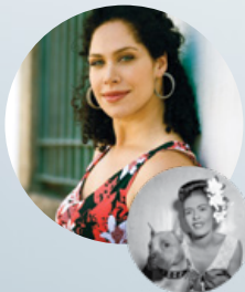
DAUGHTER OF ATLANTA'S 54 TH MAYOR MAYNARD JACKSON