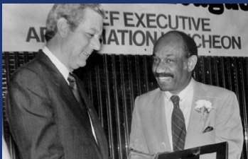
Gov. Joe Frank Harris presents Herman J. Russell with the Atlanta Business League's 1986 CEO of the year.