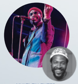
MULTI-TALENTED SINGER & ACTOR